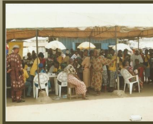
Free Health! Free tests, Free Medicines